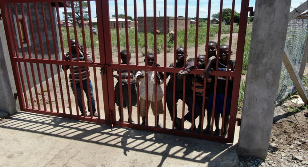
WAITING AT DESERT STREAM RADIO GATE