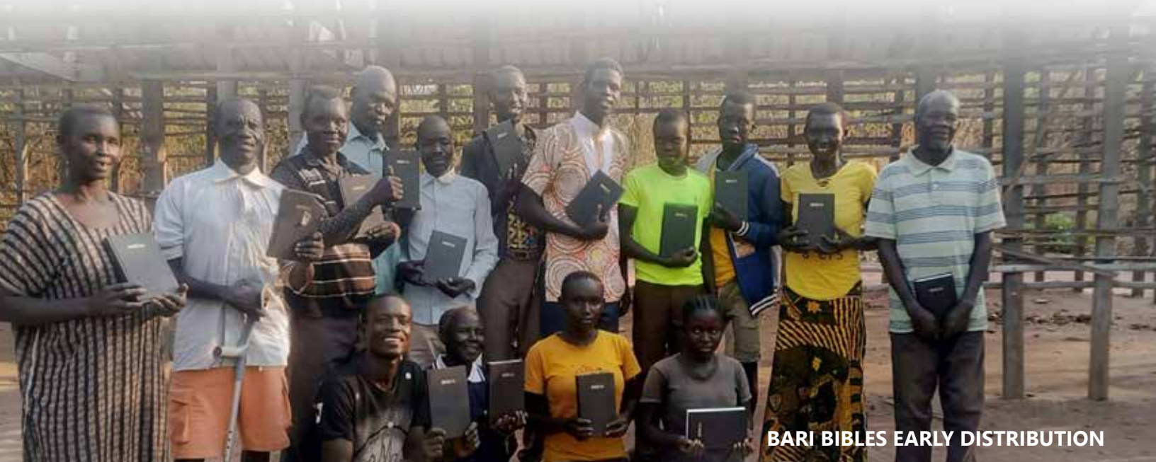
BARI BIBLES EARLY DISTRIBUTION

NOTE: It will soon be tax receipting time. Please send a quick email to us at marty@hagcm.org so we can send your tax-deductible receipt for 2025 by email (if you prefer).