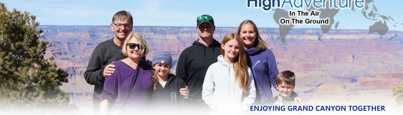
ENJOYING GRAND CANYON TOGETHER