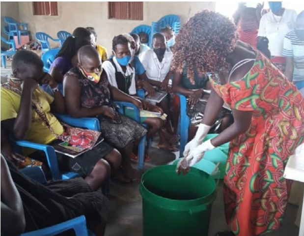
ASAMUK SKILLS STUDENTS LEARN SOAP MAKING