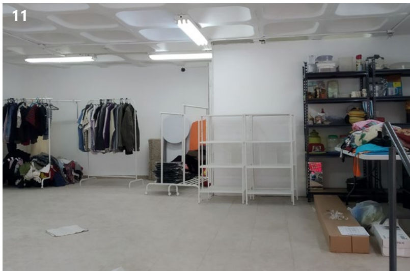
1 NAKYESSA WOMEN'S MINISTRY HUMBLE BEGINNING