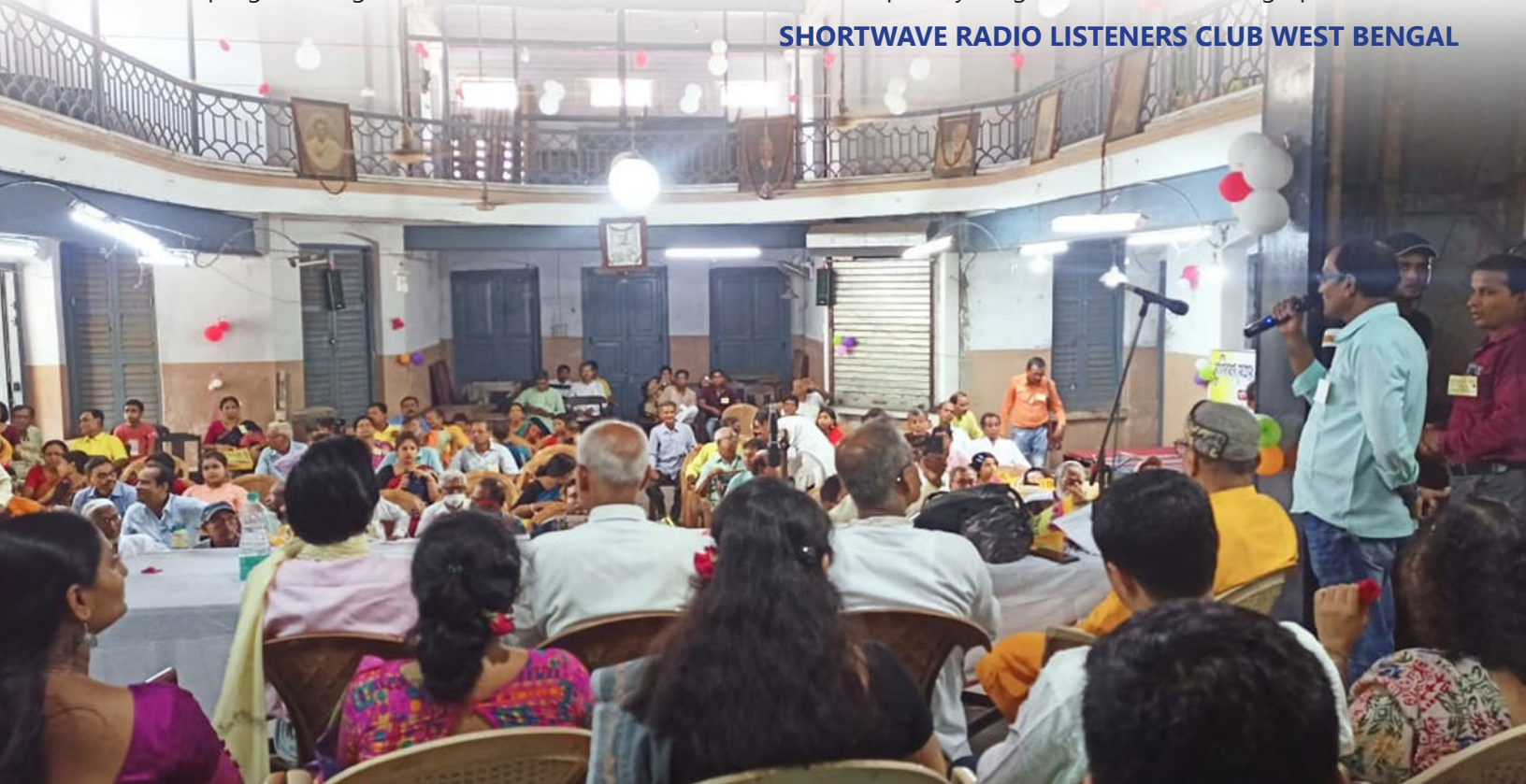
SHORTWAVE RADIO LISTENERS CLUB WEST BENGAL

But even today, radio for Africa remains the predominant affordable medium for listening. Some radio broadcasters have added their programming to Facebook, Twitter or the APPS world to capture younger or different demographics. In fact,