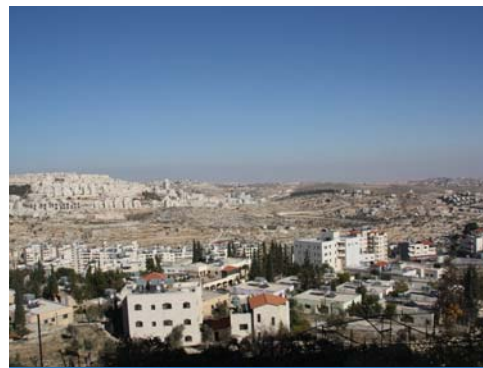
BROADCASTING ACROSS SHEPHERDS FIELDS WITH RADIO