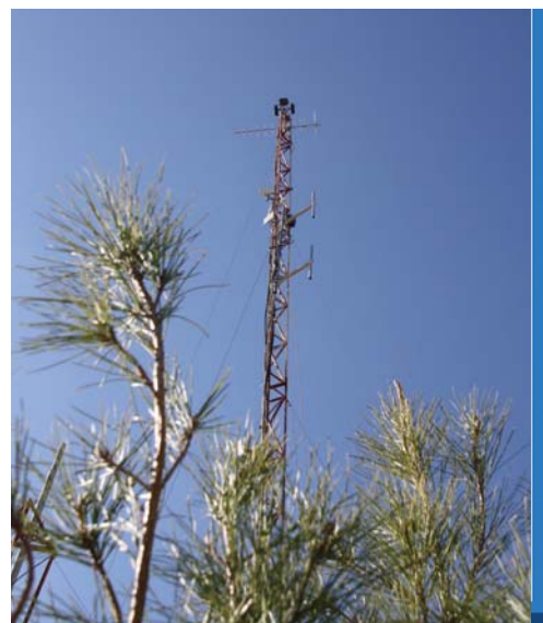
NEW TOWER IN BETHLEHEM