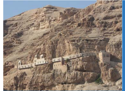
MOUNTAIN SIDE TEMPLE