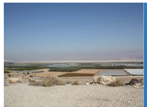
VALLEY OF MOAB AT GILGAL

HIGH ADVENTURE GOSPEL COMMUNICATION MINISTRIES