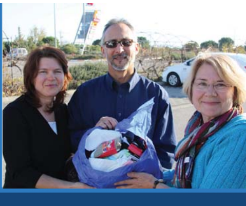
GIFTS OF CLOTHING FOR MESSIANIC CHURCH