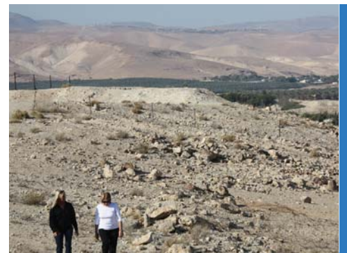
EZEKIEL 36 FULFILLMENT