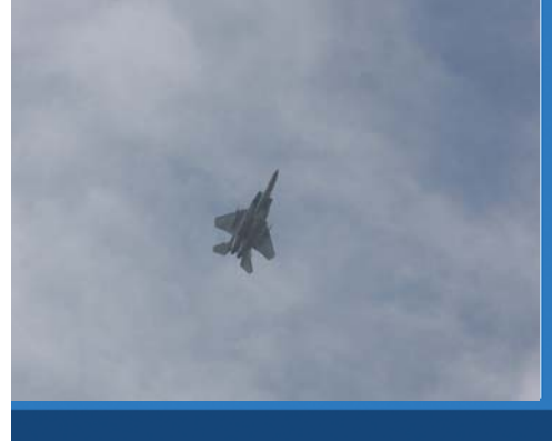
BUSY SKIES OVER ISRAELI FIELDS