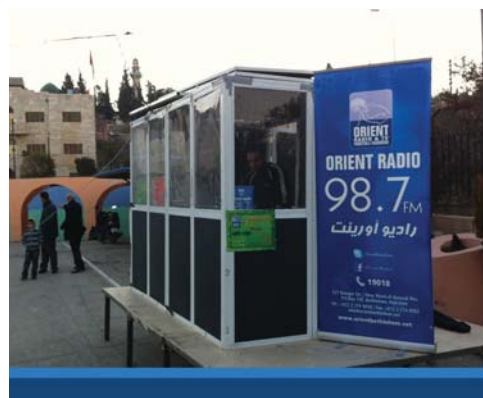
BROADCASTING FROM MANGER SQUARE IN BETHLEHEM

PLEASE COMPLETE THE PORTION BELOW AND RETURN IN THE ENVELOPE PROVIDED. THANK YOU.