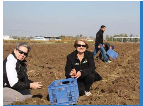
GLEANNING SWEET POTATOES FOR NEEDY