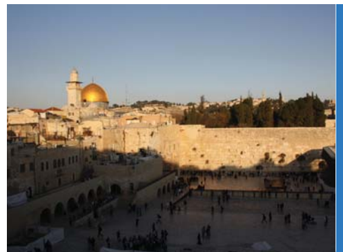
REACHING TO BOTH BROTHERS WITH RADIO