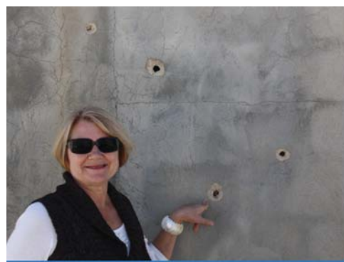
BULLET HOLES IN OUR BETHLEHEM BROADCAST STUDIO