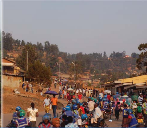
HILLS OF RWANDA