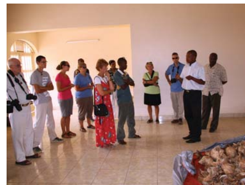
DISCOVERING RWANDAN HISTORY