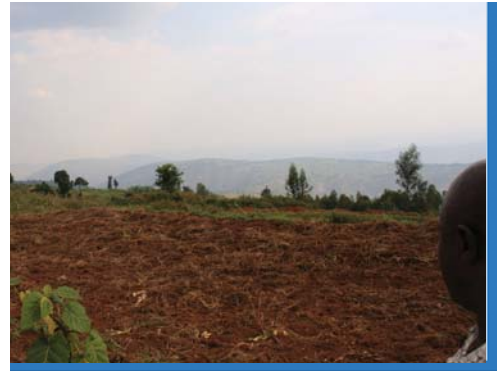
PASTOR JOSEPH'S VISION FOR RWANDA