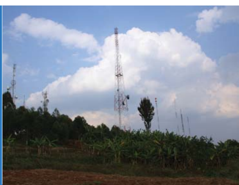
STRATEGIC BROADCAST MOUNTAINTOP