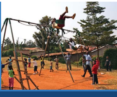
RWANDESE CHILDREN ENJOYING SWINGS AT SCHOOL

Walking along the dusty road, with huge towers on either side-like soldiers guarding the airwaves over Rwanda, we soon arrived at Joseph's "promised land". It was a one-acre parcel of property looking high over the hills of Rwanda, affording spectacular view of one of the continent's most beautiful nations. More importantly, it represented to Joseph, an open window into villages, communities and fields that were until now, hidden from Restore FM radio.