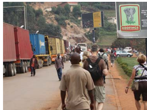
NO MAN'S LAND

No letter-no photo-no description can ever adequately describe the breathtaking reality of seeing 4000 people (including an entire high school student population) reduced to a huge pile of bones, many which reveal the machete blows that crushed their skulls.