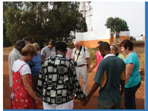
PRAYING FOR NEW RESTORE FM SITE