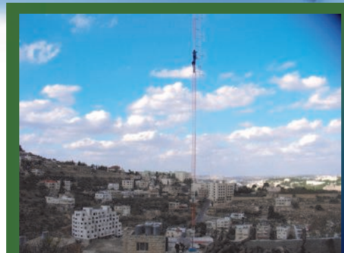
BEIT JALA TOWER IN EARLY 2010

DECEMBER 13...Elias called from Bethlehem. “ Don, it is terrible. Our whole area suffered a long day of high winds. They were so bad, people could not drive from sand flying around and worst of all, our tower fell down to the street, smashing all the equipment...I don't know what to do. ”