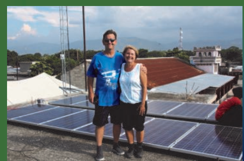
ROOFTOP SOLAR INSTALLATION IN HAITI

HIGH ADVENTURE GOSPEL COMMUNICATION MINISTRIES