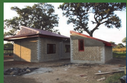
NEW ONGUTOI MEDICAL BUILDINGS IN 2010