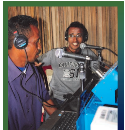
INDONESIAN RADIO ON REMOTE ISLAND

AND...If you are interested in a visual journey of our recent DO SOMETHING trip to Israel, simply ask for your gift copy of this 12-minute DVD and we will rush it to you...who knows...perhaps next year in Jerusalem?