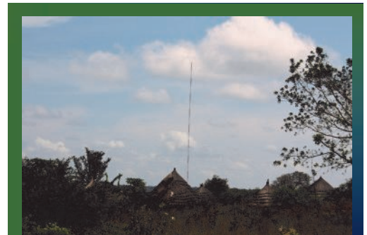
SAVIOR FM REACHING INTO UGANDAN HUTS