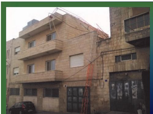
BEIT JALA TOWER DOWN